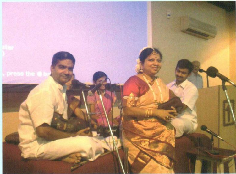
Performing a harikatha kalakshepam.